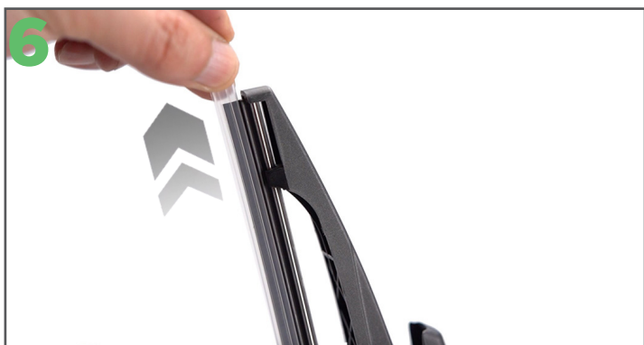
Don't forget to remove the protective sleeve from the Ezywiper blade before placing the arm back on the rear screen.