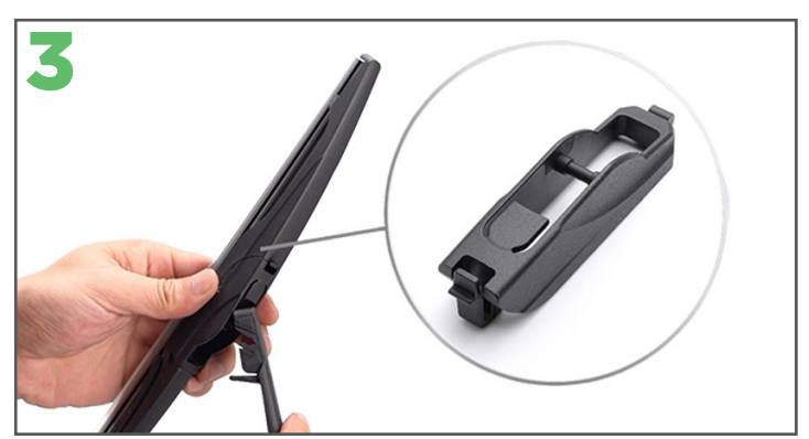
To fit the new Ezywiper blade, align the centre of the Push the blade down and rotate it so the connector's connector's cross pin with the hook on the arm.