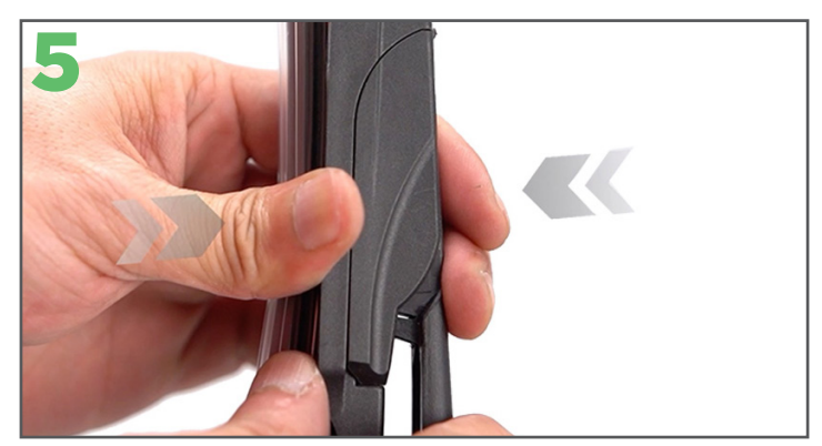
Continue to rotate the blade until it locks into place on the arm.