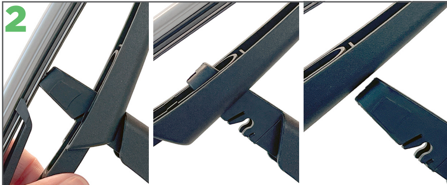
To remove the current wiper blade gently rotate and pull the blade away from the arm until it disengages.