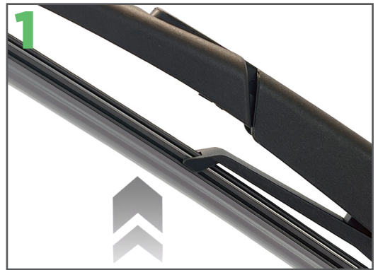
Lift the car's rear wiper arm off the rear screen as far as it will go.