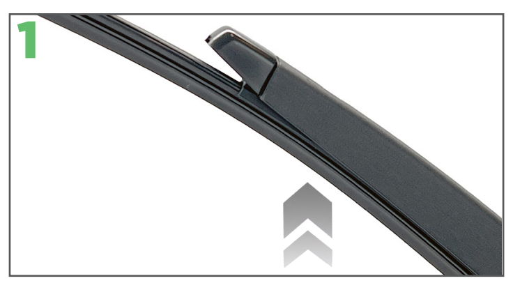
Lift the car's rear wiper arm off the rear screen as far To remove the current wiper blade push the button as it will go.