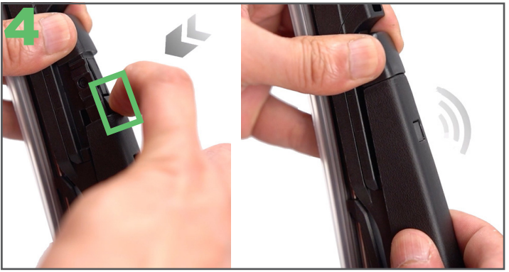
the Ezywiper blade in until it locks into place.