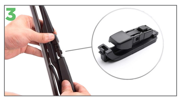
To fit the new Ezywiper blade, line the wiper blade up Push the button on the connector as you firmly slide with the arm.