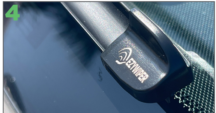
Check the low spoiler side of the blade faces the bottom of your windscreen.