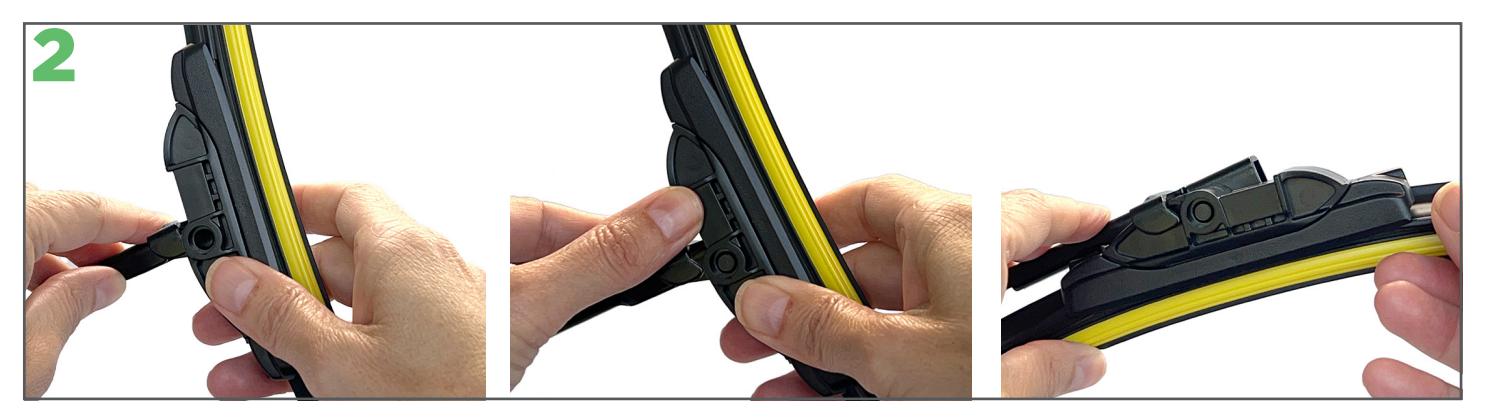
Next, remove the new Ezywiper blade from its packaging.

To install the Ezywiper blade, hold the wiper at 90° and slide the hole into the pin on the arm. Rotate the blade into position.