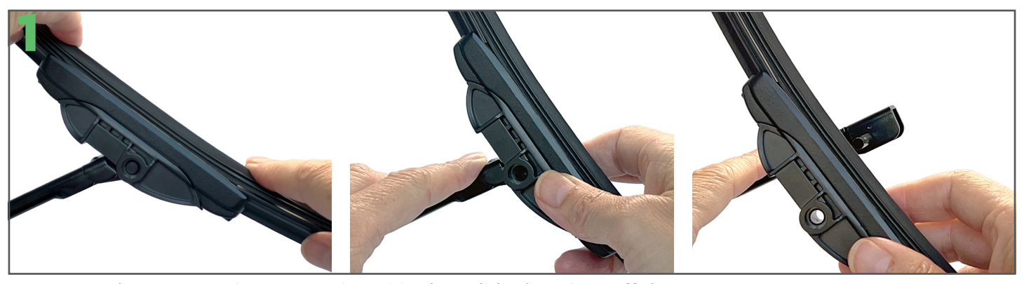
To remove the current wiper, rotate it to 90° then slide the wiper off the arm.