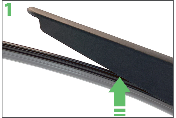
Lift the car's rear wiper arm off the rear screen as far as it will go.