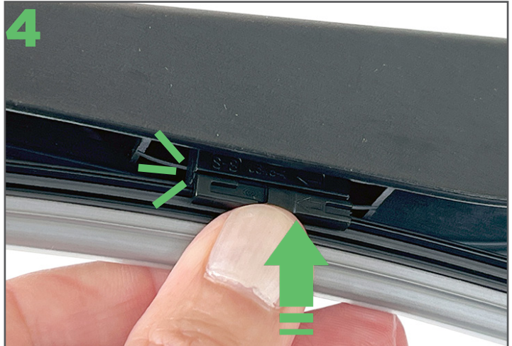
Gently push the Ezywiper blade onto the arm until it locks into place.