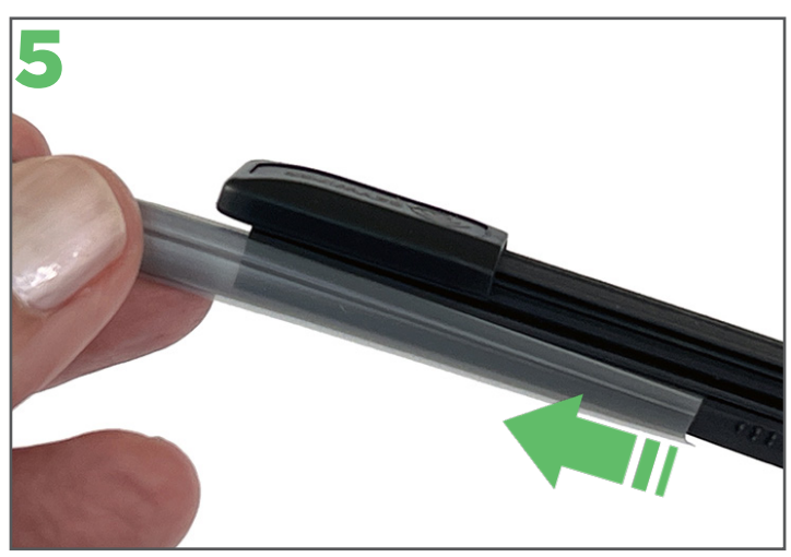
Don't forget to remove the protective sleeve from the Ezywiper blade before placing the arm back on the rear screen.