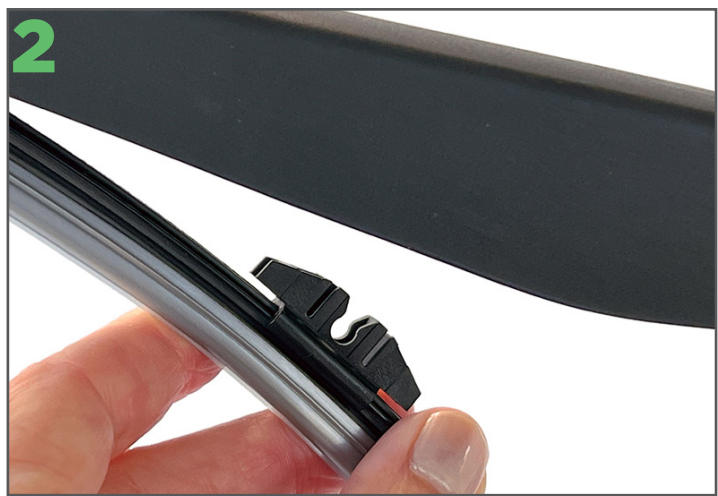
To remove the current wiper blade gently rotate the blade away from the arm until it disengages.