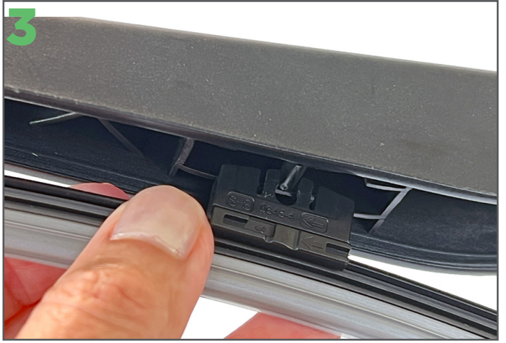
To fit the new Ezywiper blade, align the blade with Gently push the the arm. The arrows on the mount and adaptor point locks into place. to the front of the arm.