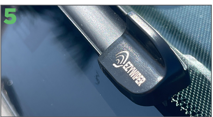
Check the low spoiler side of the blade faces the bottom of your windscreen.