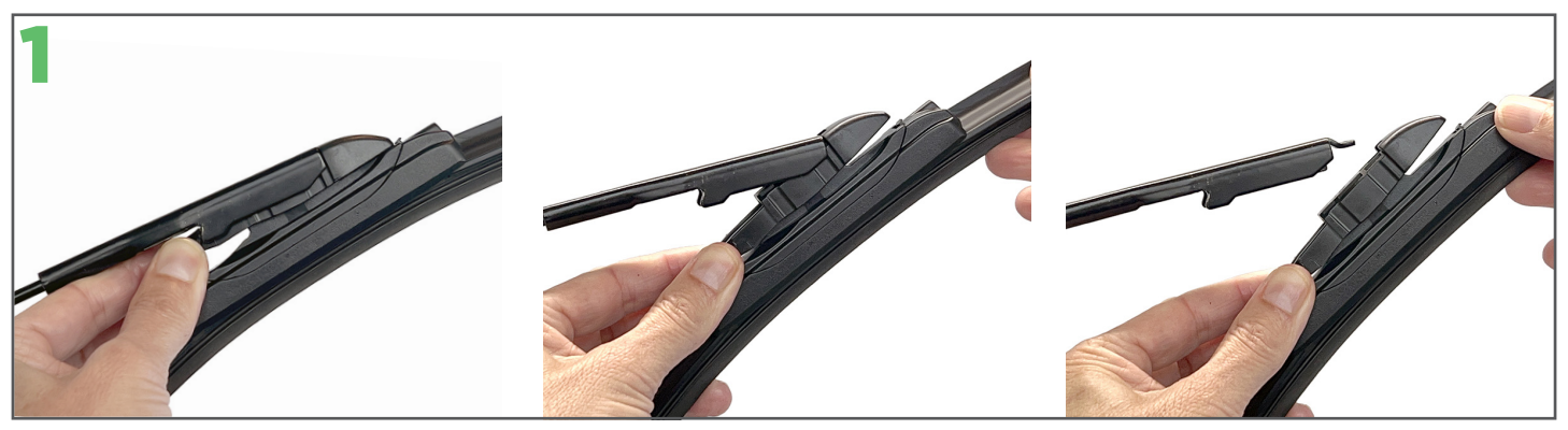
To remove the current wiper blade pinch the tabs on both sides of the connector and rotate the wiper away from the arm.